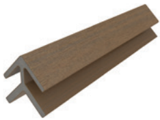
US46 Outside Corner Trim