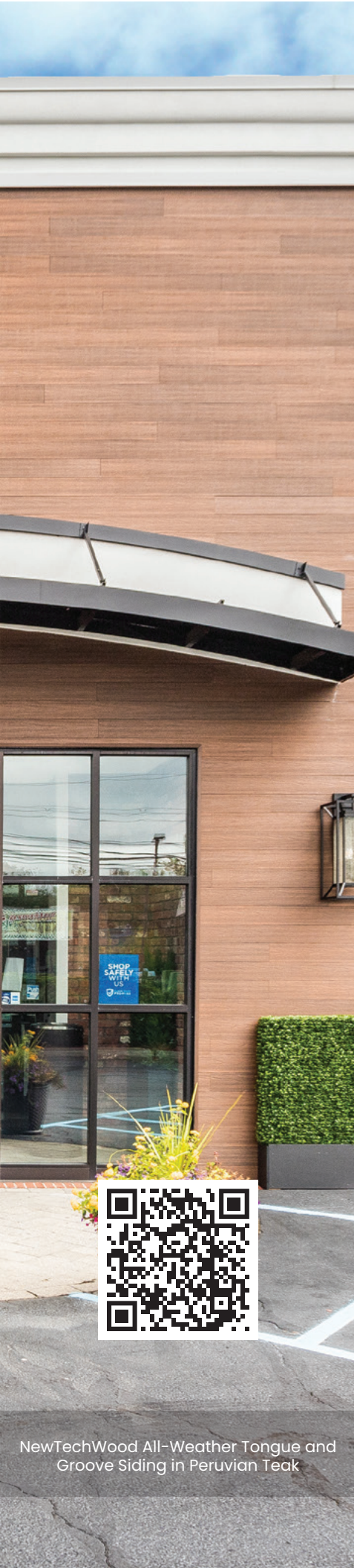
NewTechWood All-Weather Tongue and Groove Siding in Peruvian Teak