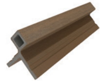
UH51 Outside Corner Trim