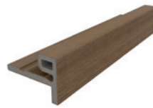
UH50 End Trim