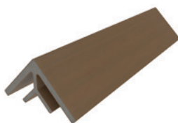
US47 Inside Corner Trim